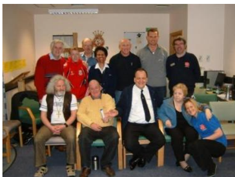
Certificates being presented on completion of Alpha course in Salvation Army

Centre was special – also a beautiful location. Enclose photo of the presentation of the certificates on the last night.